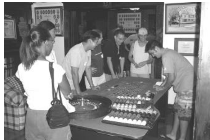
Brothers and guests at the roulette table on Casino Night.

rest of the week's events served as reaffirmation that they had made the right choice in Phi Kappa Tau. Friday night's Mocktail Luau showed a glimpse of the party-side of the chapter, and Saturday night's Preference Dinner showed a more serious, business-like side of the chapter. These events closed out a very successful rush week and anticipation grew in the actives for the following Thursday's installation.