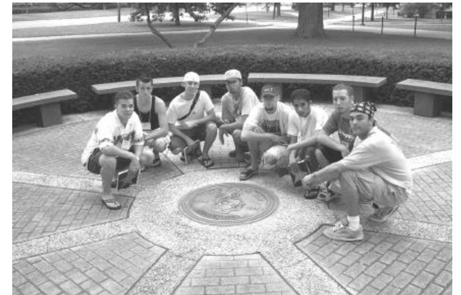
Brothers at the Phi Kappa Tau seal; Miami University, July 2001